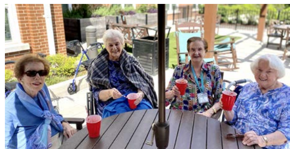
River Banks ladies enjoying the sunshine!