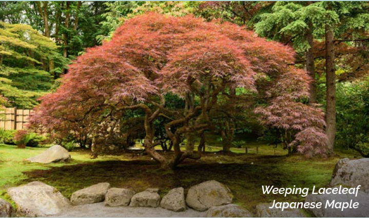
Weeping Laceleaf Japanese Maple