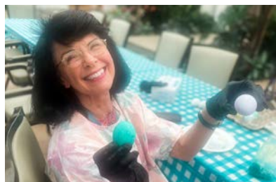
Dyeing Easter eggs!