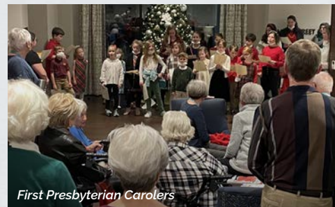
First Presbyterian Carolers