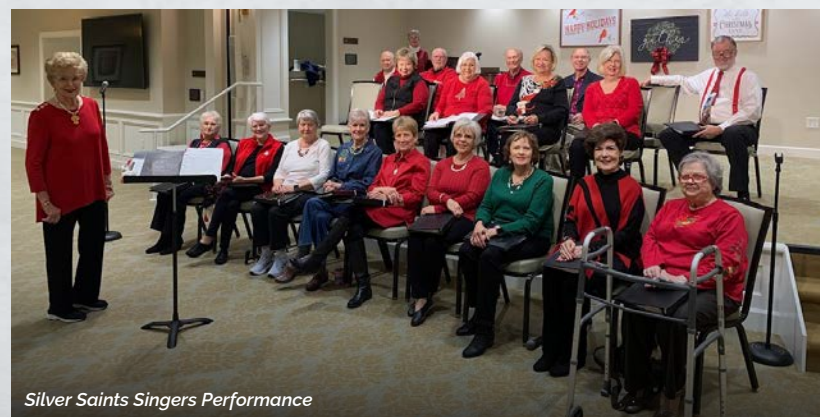
Silver Saints Singers Performance