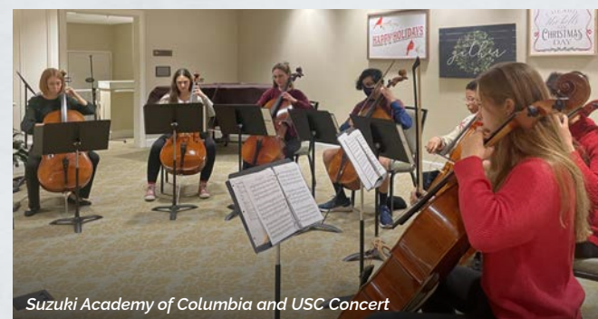
Suzuki Academy of Columbia and USC Concert