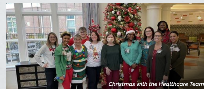
Christmas with the Healthcare Team