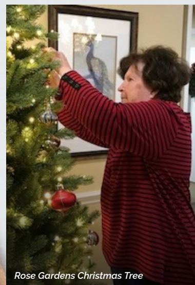
Rose Gardens Christmas Tree