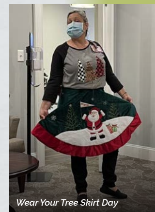
Wear Your Tree Skirt Day