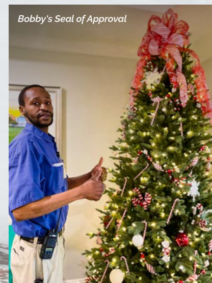
Bobby's Seal of Approval