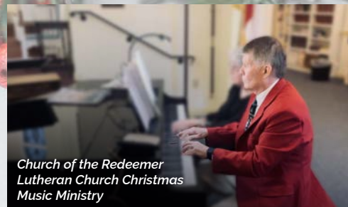
Church of the Redeemer Lutheran Church Christmas Music Ministry