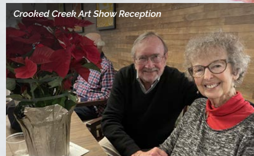
Crooked Creek Art Show Reception