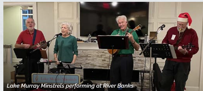
Lake Murray Minstrels performing at River Banks