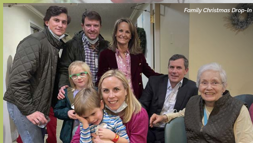
Family Christmas Drop-In