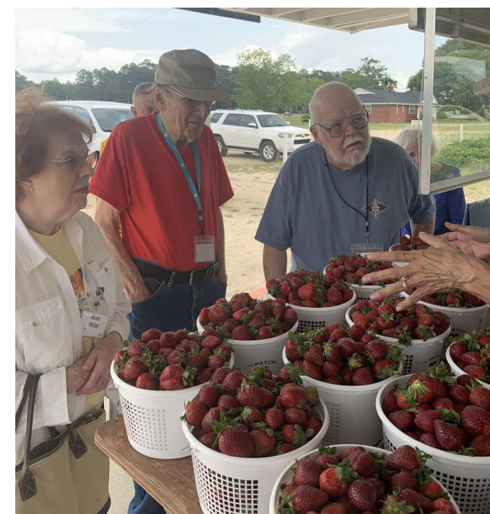
Residents enjoyed a trip to the strawberry patch.