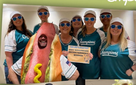
Best Entertainers: Human Resources, The Champions