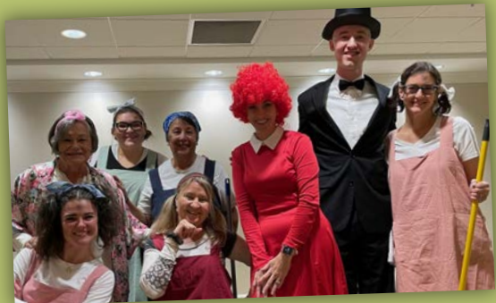
Life Engagement: Annie, the Musical