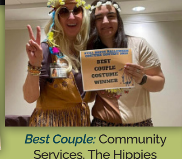
Best Couple: Community Services, The Hippies