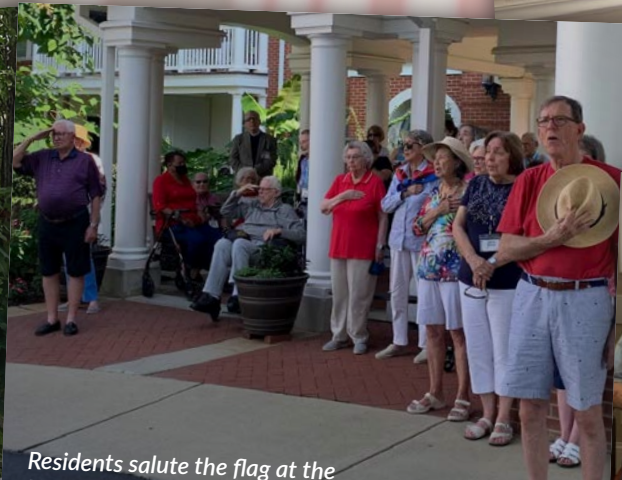
Residents salute the flag at the Independence Day Celebration.