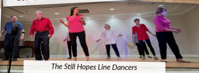
The Still Hopes Line Dancers