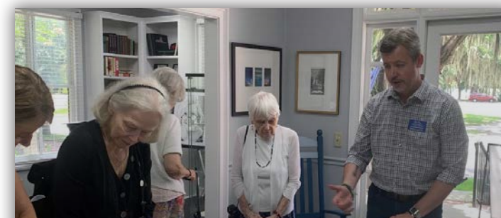
Residents enjoyed a visit to the Pat Conroy Literary Museum in Beaufort, SC.