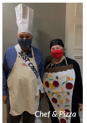
Chef & Pizza