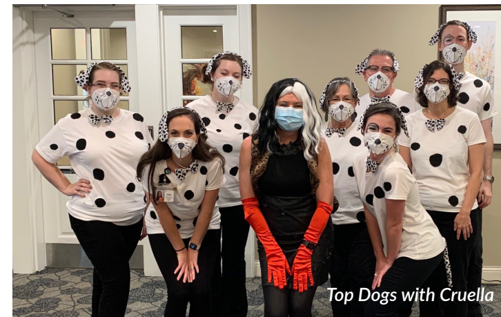
Top Dogs with Cruella