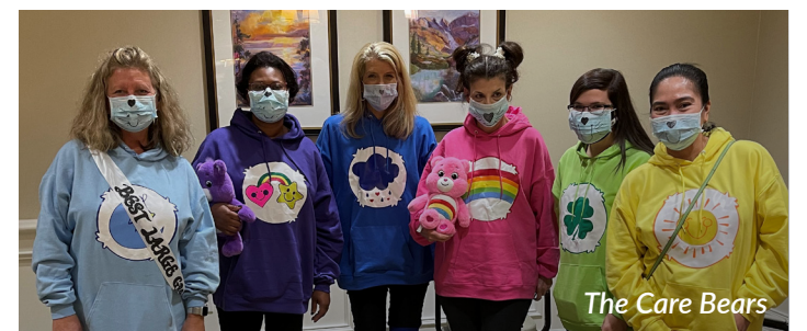
The Care Bears

After the contest, those dressed to impress participated in the Halloween Costume Parade on Main Street, through Emilie's Café, and Greenway neighborhoods. Congratulations to all the winners!