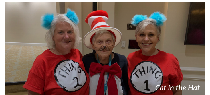
Cat in the Hat

Best Entertainers: The Skittles, Greenway Nursing Staff & Healthcare Dietary